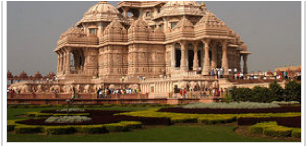
The Akshardham Hindu temple, Delhi

Indian music is represented in a wide variety of forms. The two main forms of classical music are Carnatic from South India, and Hindustani from North India. Popular forms of music also prevail, the most notable being Filmi music. In addition to this are the diverse traditions of folk music from different parts of the country. Many classical dance forms exist, including the Bharatanatyam, Kathakali, Kathak and Manipuri. They often have a narrative form and are usually infused with devotional and spiritual elements. The earliest literary traditions in India were mostly oral, and were later transcribed. Most of these are represented by sacred works like the Vedas and the epics of the Mahabharata and Ramayana. Sangam literature from Tamil Nadu represents some of India's oldest traditions. There have been many notable modern Indian writers, both in Indian languages and in English. India's only Nobel laureate in literature was the Bengali writer Rabindranath Tagore. India produces the world's largest number of films every year. The most recognisable face is that of cinema production based in Mumbai, which produces mainly commercial