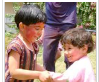
Holi, the festival of colours has emerged as one of the most popular Indian festivals.

India has three National Holidays. Other sets of holidays, varying between nine to twelve, pertains to festivals, religious holidays and births of leaders which are legislated by the individual states.