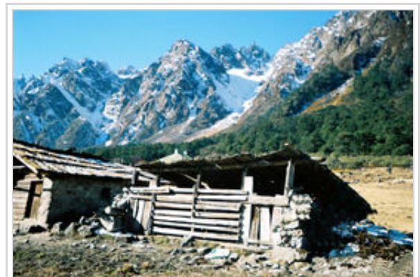
The Himalayas stretch from Jammu and Kashmir in the north to Arunachal Pradesh in the far east making up most of India's eastern borders