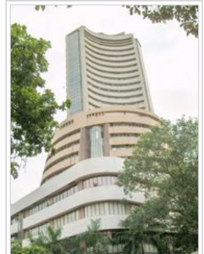
The Bombay Stock Exchange sensitive index is used as a determinant of the strength of the Indian economy.

India is the second-most populous country in the world with an estimated 1.19 billion people in 2006. Almost 70% of its population reside in rural areas. India's largest urban agglomerations are Mumbai, Kolkata, Delhi, Chennai and Bangalore. Efforts to irradicate illiteracy have met with little success since India's