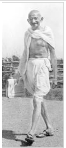
Mahatma Gandhi is also known as the Father of India.

The Sanchi stupa in Sanchi, Madhya Pradesh built by emperor Ashoka in the 3rd century BC