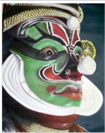
Face of a Kathakali artist, a type of Indian classical dance, from Kerala.

India has a rich and unique cultural heritage, and has managed to preserve its established traditions throughout history whilst absorbing customs, traditions and ideas from both invaders and immigrants. Many cultural practices, languages, customs and monuments are examples of this co-mingling over centuries. Famous monuments, such as the Taj Mahal and other examples of Islamic-inspired architecture have been inherited from the Mughal dynasty. These are the result of a syncretic tradition that combined elements from all parts of the country.