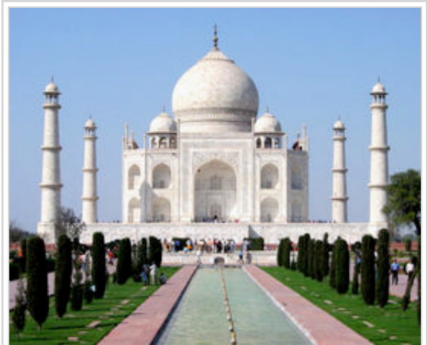
The Taj Mahal in Agra is India's most popular tourist destination.